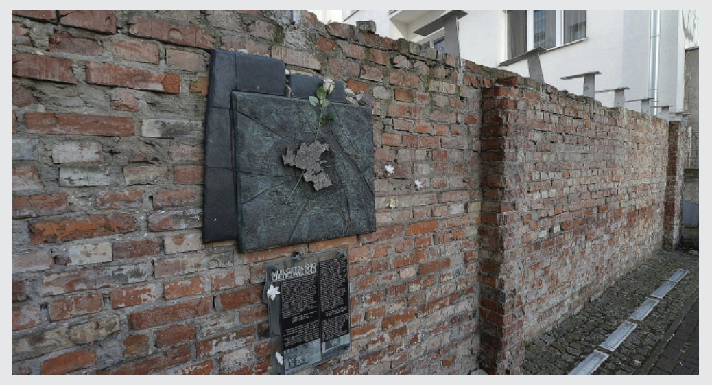
A fragment of the former Warsaw Ghetto wall in Sienna street, February 2018