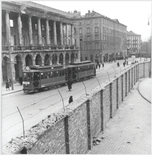
The wall separating the ghetto from the Aryan zone, May 1941