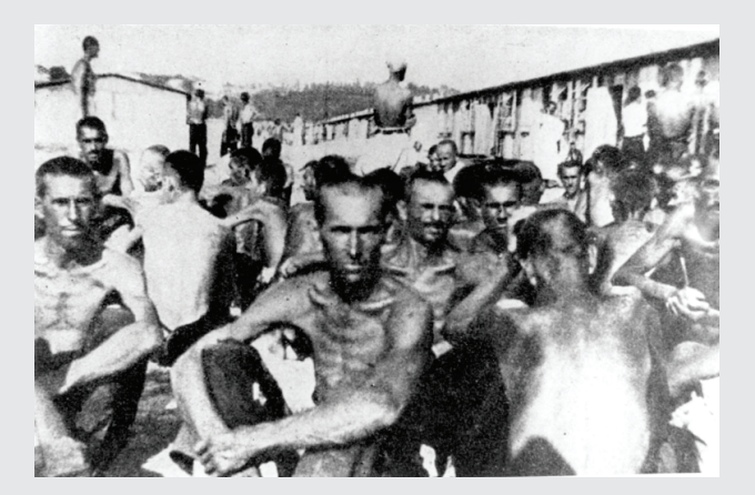
A group of prisoners in the concentration camp

Concentration and extermination camp Sajmište, Belgrade, Serbia (Yugoslavia)