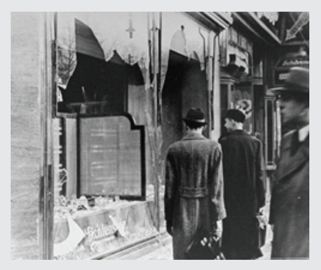
Germans passing by the broken shop window of a Jewish-owned business that was destroyed during Kristallnacht