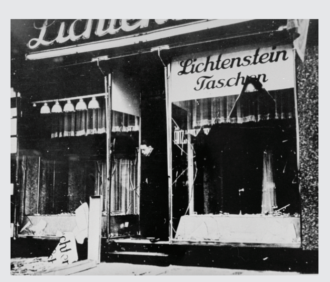
A man surveys the damage to the Lichtenstein leather goods store after the Kristallnacht pogrom