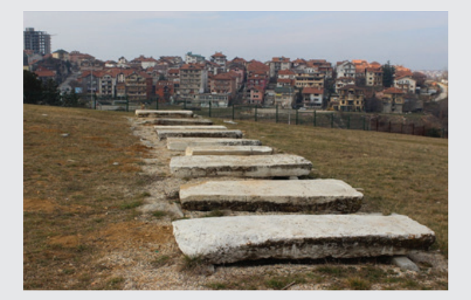
Jewish cemetery in Velania