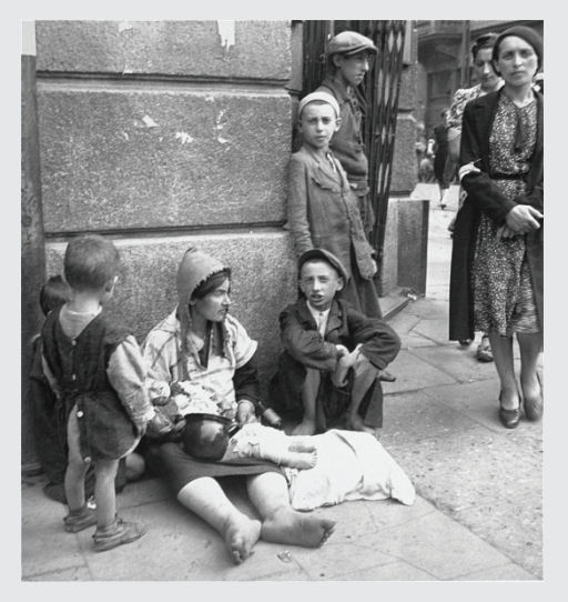
A destitute woman and her children on a street in the Warsaw ghetto, September 1941