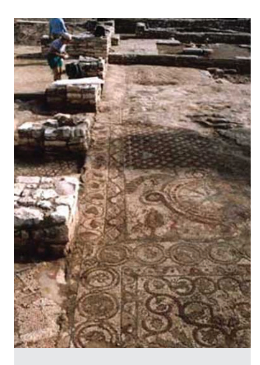
Ruins of a Synagogue in Saranda, 6th century AD