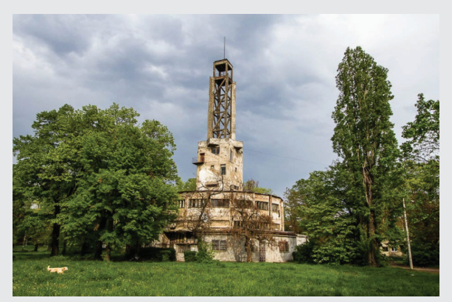
The location of the Sajmište Camp today / Sajmište Concentration Camp Memorial