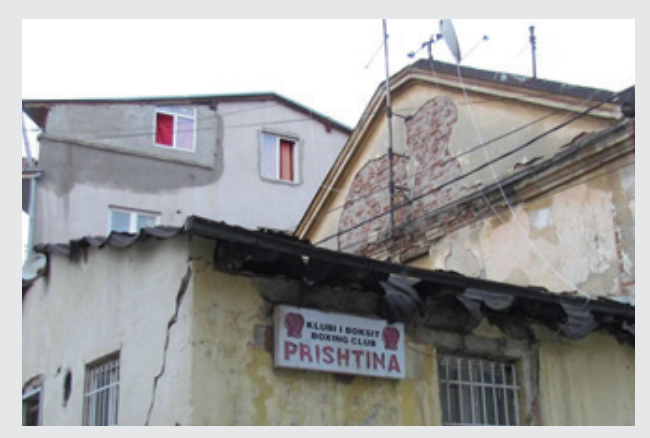
Boxing Club Prishtina, an abandoned building which is believed to have once housed a Jewish school.

Source: https://en.wikipedia.org/wiki/Historical_monuments_in_Pristina#Jewish_cemetery