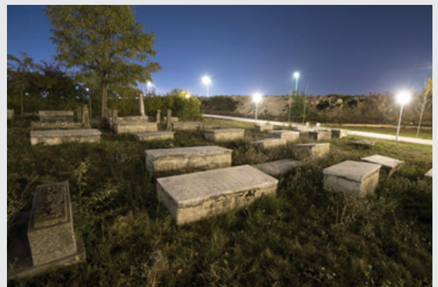
Jewish cemetery in Arberia/Dragodan