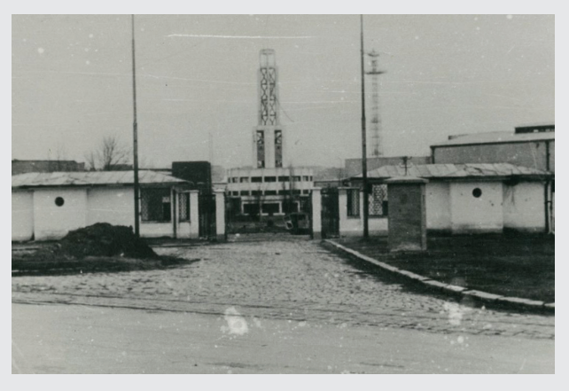
Main entrance of the camp and control tower